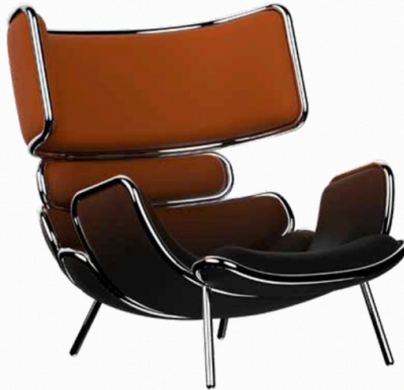
Limited Edition Armchair Dimensions: 85 x 90 x H100 Seat Height: 36 Code: ES002CR